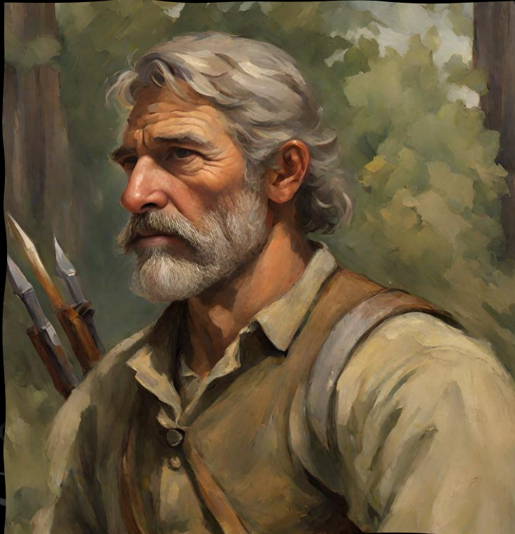
Halt from John Flanagan's "Ranger's Apprentice"