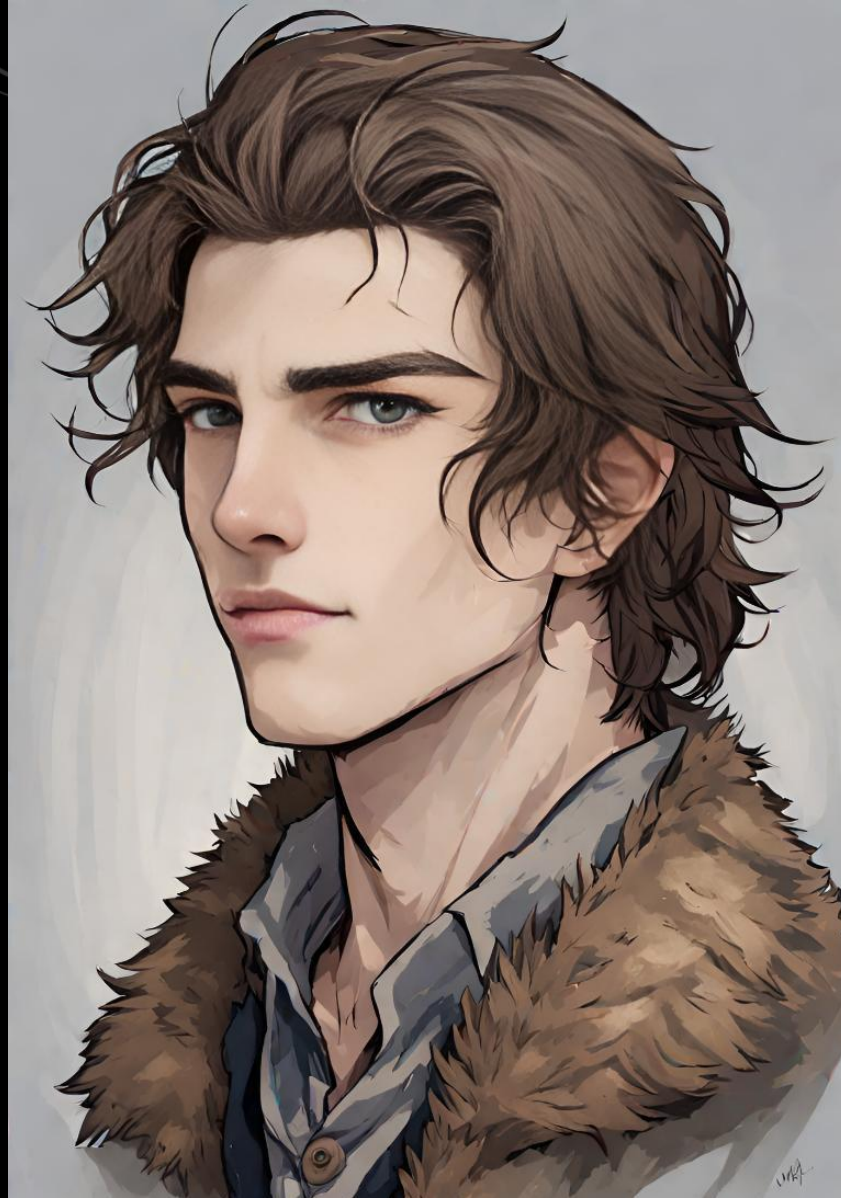
Will from John Flanagan's "Ranger's Apprentice"