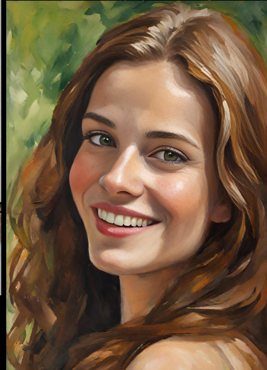
Stella from Ana Huang's "Twisted Lies"